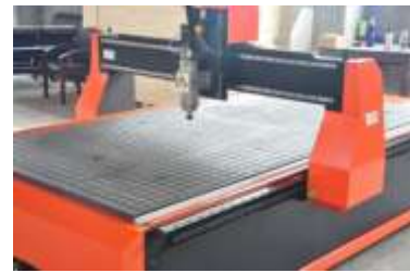
Figure 5 . CNC Machines