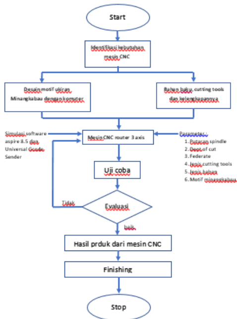
Figure 1 : Scheme Research

8. Finishing is done by providing a creative product display that is attractive and has the highest quality selling value