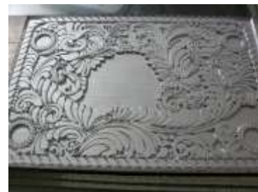
Figure 6 . CNC Result