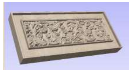
Figure 4 . Kaluak Paku in 3D Model

router machine has is marking or marking. What is meant here is to give marks on the wood that will be used. So that the finishing touch will be appropriate and neat.