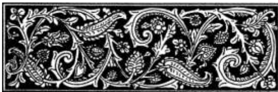
Figure 2 . Kaluak Paku in 2D

The first test is a picture of Minangkabau carving with the name Kaluak Paku. Usually these carvings are on the walls of the rumah gadang. The manual creation can take 2 to 3 months for a novice engraver. In the professional engraver category, it can take up to 3 weeks to 1 month at a fairly high cost.