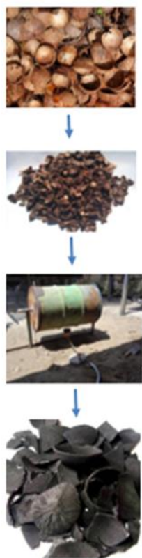
Figure 1. Biochar Manufacturing Process

VCO manufacturing waste, namely coconut shells grouped also in agricultural waste, when processed pyrolysis produces Biochar [8]. Biochar resulting from the imperfect burning of coconut shells can increase the quality of agricultural land, through absorption by Carbon, which causes an increase in the availability of P, N and K in the soil [7], [9], so as to increase crop production [8], [10]–[12]. The elements N, P and K are indispensable in the biochemical reactions of plants for their survival and production.. Likewise, Biochar has a sufficient concentration of micro and macro elements such as sodium, copper, potassium, calcium, zinc, magnesium, iron, etc. [6] that can support the survival and production of plants.